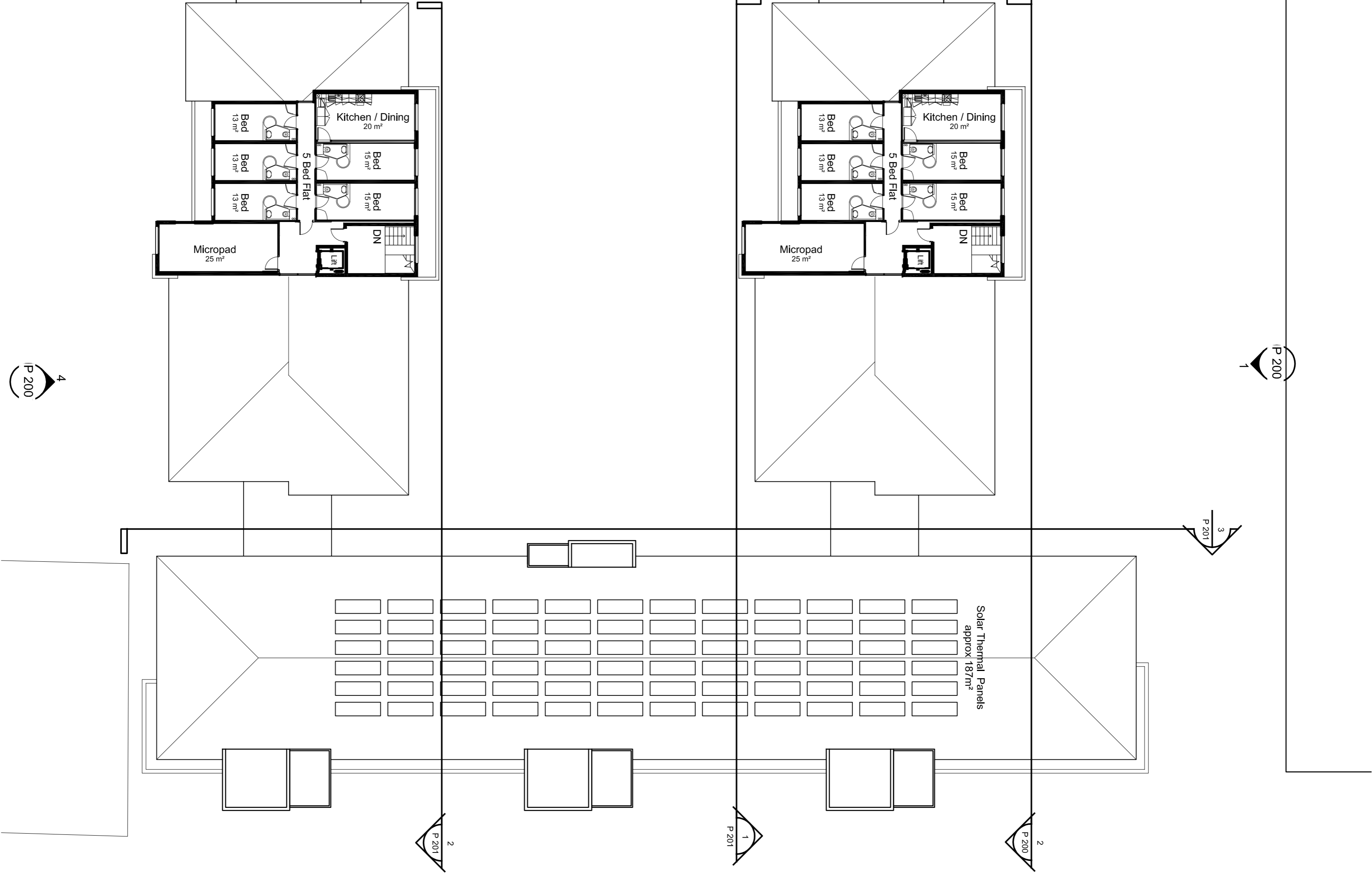
1 04 Fourth Floor 1 : 200